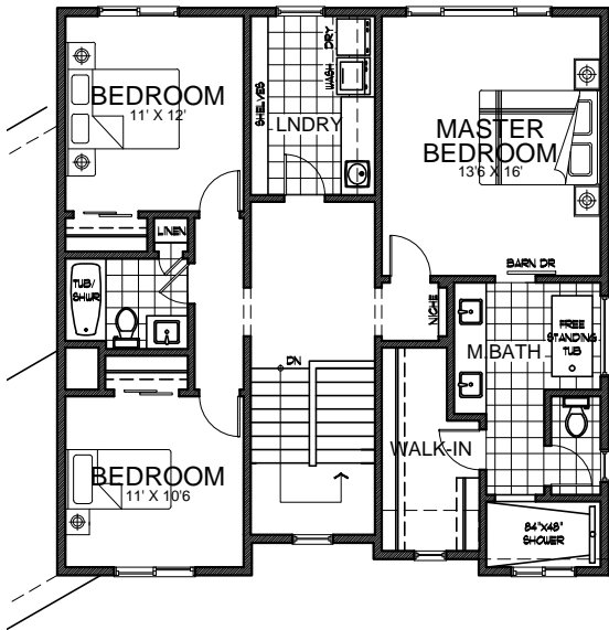
2nd Floor 1088 sq ft